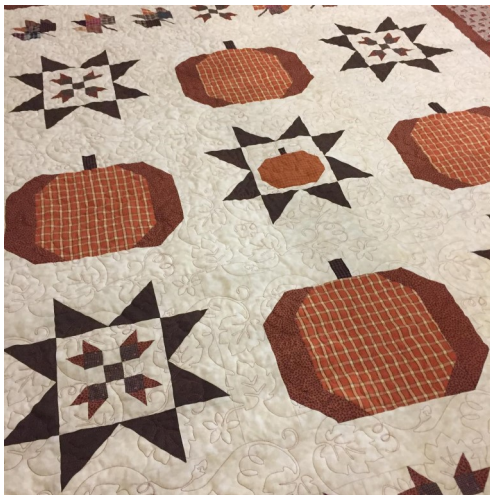
Pumpkin Picking quilt by Lori Millsap

I love this time of year, when temperatures are a bit lower and pumpkin patches start to be set up all over town. When they were younger, one of my favorite picture books to read to my children during this time of year was The Littlest Pumpkin by R.A. Herman. It's set at a pumpkin stand, where there are pumpkins of all shapes and sizes for children to pick out for Halloween. Pumpkins that are tall and narrow, short and wide, lumpy and bumpy, very big, very small, some with stems, some without, etc. Each child comes searching with a specific shape or size in mind for their ideal pumpkin. The littlest pumpkin really wants to be picked, but by the time the stand closes for the night, she's the only pumpkin left. Happily, her wishes come true when she becomes the centerpiece of the mice's Halloween party.